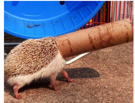
Unicorns are misunderstood. This unicorn is deranged.

Meanwhile, our co-reporter is absent on a brief - OH GOD, BUCKY! 🐾